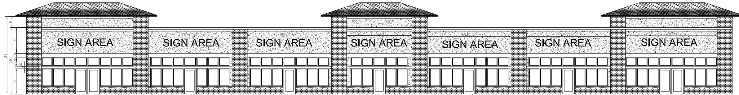
1 FRONT ELEVATION 3 B 1/16" = 1'-0"

Design Services, LLC holds the copy right of all these plans and drawings. No part of these plans or drawings may be reproduced, stored in a retrieval system, or transmitted in any form or by any means, electronic, mechanical, photocopying, recording, or by any information storage and retrieval system, without the prior written permission of Design Services, LLC. These plans and drawings are for the construction of one dwelling only. Design Services, LLC is not responsible for the accuracy of the information contained herein. Design Services, LLC is not responsible for the effect such information may have in the accuracy of the drawing.